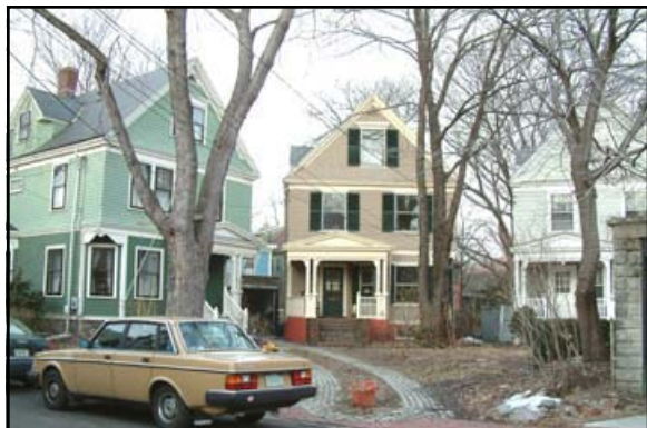
A 100 year old development in Cambridge clusters three houses around a green.

Site 24, Map 40 8.55 Acres, 372,506 sq.ft. Zone – SR Single Residence