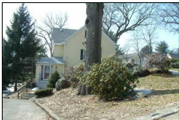
Careful siting can work around natural site features.