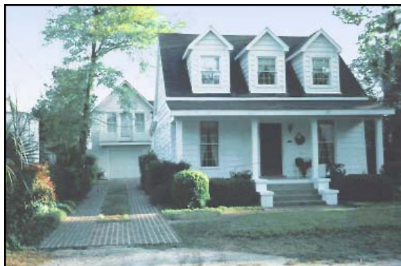
Placing garages behind houses allows porches and landscaping to define public street.